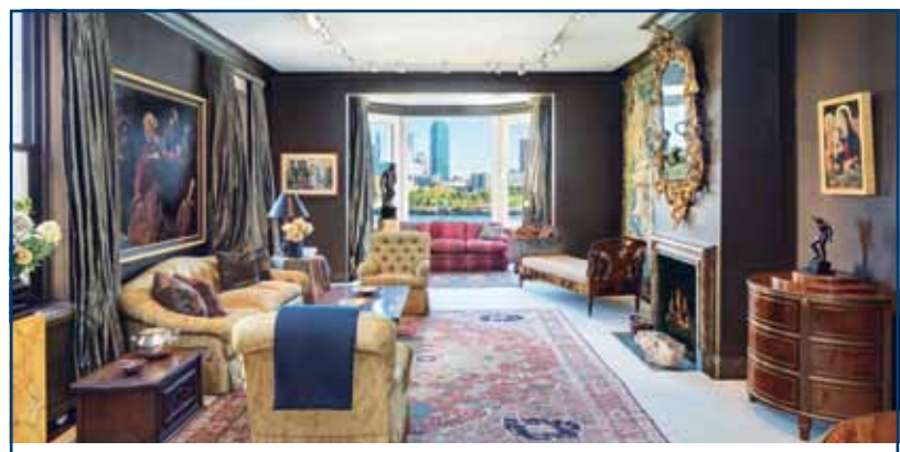
USA, NEW YORK

65+ ft of direct river views ◆ private entrance ◆ prestigious co-op building ◆ 5 bedrooms ◆ 7.5 bathrooms ◆ 6,000 sq ft ◆ amenities galore within the building Guide US$8.25 million